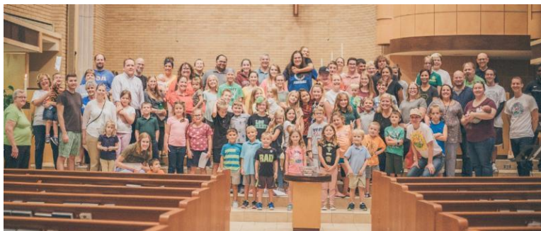
Wednesday Night Worship