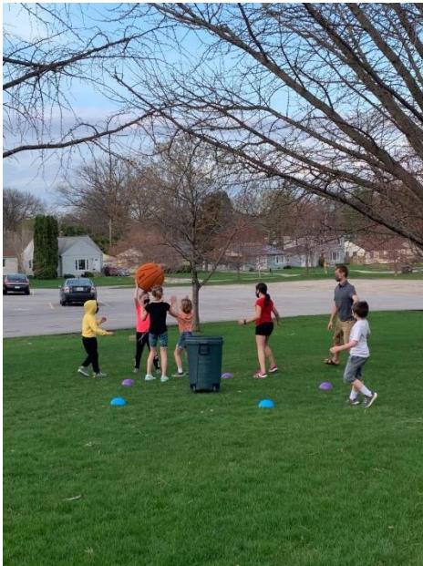
Wes Pres Kids

Wednesday, April 28 will be the last Wednesday until the fall. We will have games and a celebration! All will be meeting at their normal times!