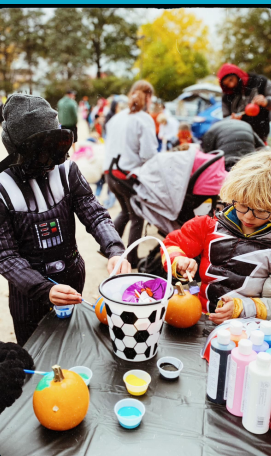
Trunk or Treat