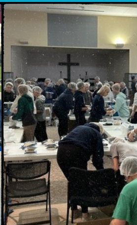
Feed My Starving Children