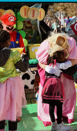
Trunk or Treat