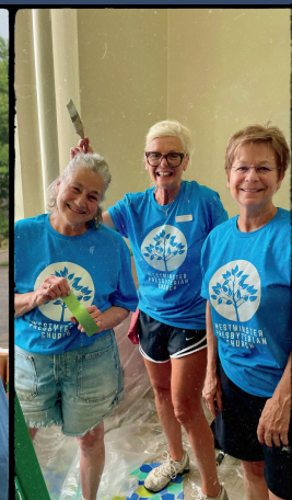
Day of Service